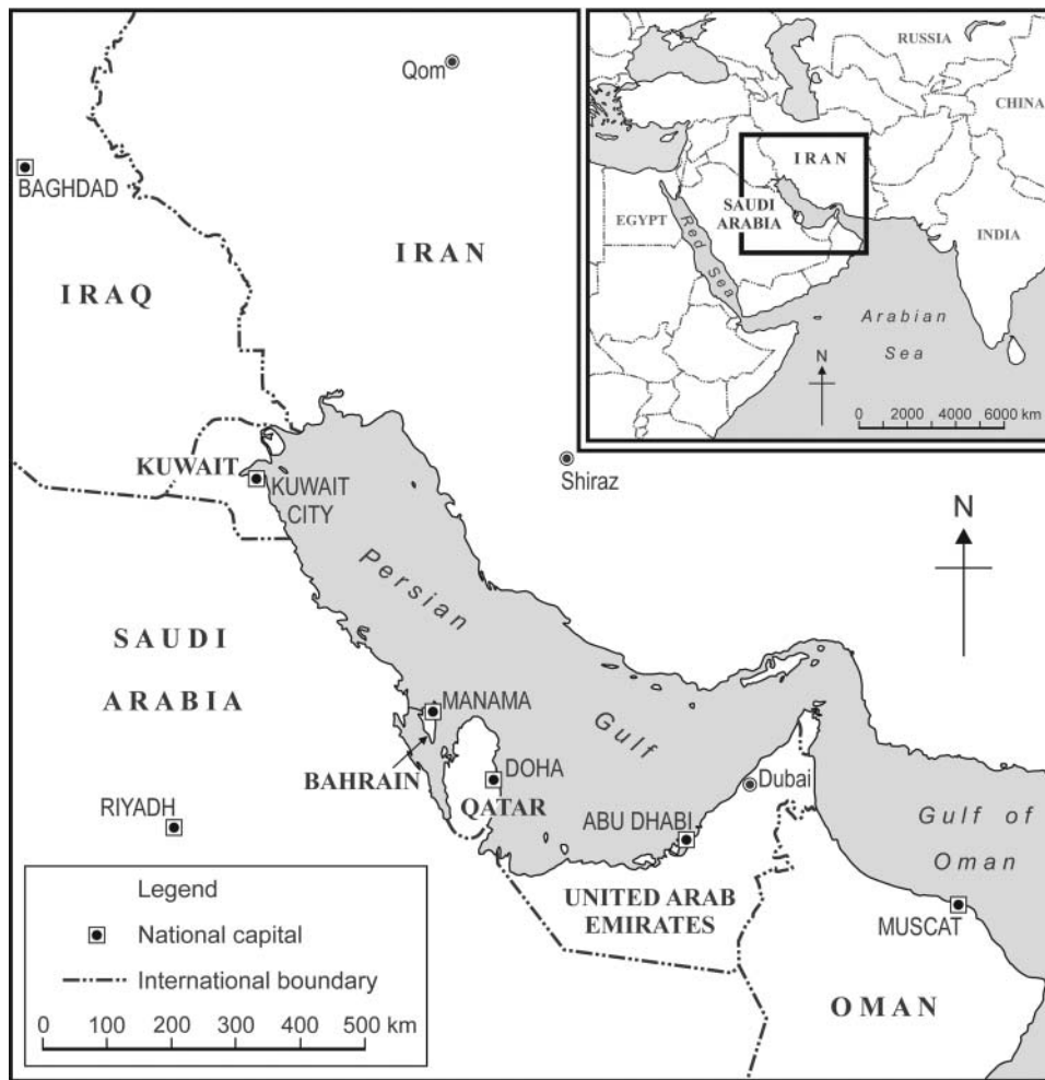
Figure 3. Qatar's regional context.

overseas headquarters for areas between Libya and China, and Al Jazeera Media. It also includes ownership of London's flagship department store (Harrods) and the 306-meter Shard, the tallest building in Europe, as well as ownership of nearly a fifth of Volkswagen and Porsche, a large share of Miramax Films, and the Paris Saint-Germain Football Club.