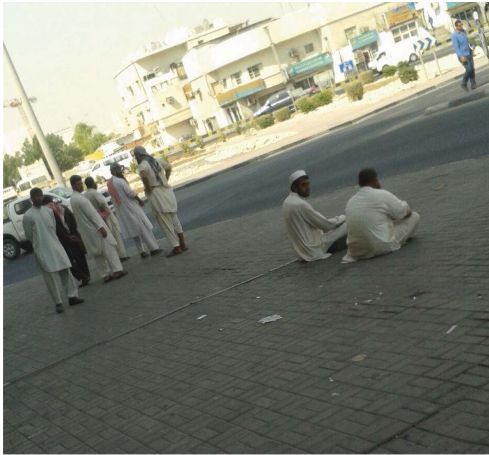
Figure 10. Casualized migrant labor markets. (Color figure available online.)

midmorning. During the last period of fieldwork, one of us [James] sat and observed the hiring process: