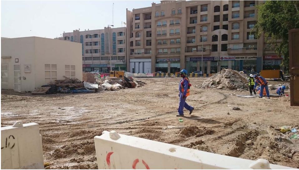
Figure 5. Clearance of dwellings in Al Ghanim, April 2015. (Color figure available online.)

Msheireb Downtown Doha will transform the centre of the capital city, recreating a way of living that is rooted in Qatari culture. Msheireb is the world's first sustainable downtown regeneration project, that will revive the old commercial district with a new architectural language that is modern, yet inspired by traditional Qatari heritage and architecture—its proportion, simplicity, space, light, layering, ornament and response to climate. (Msheireb Properties 2016)