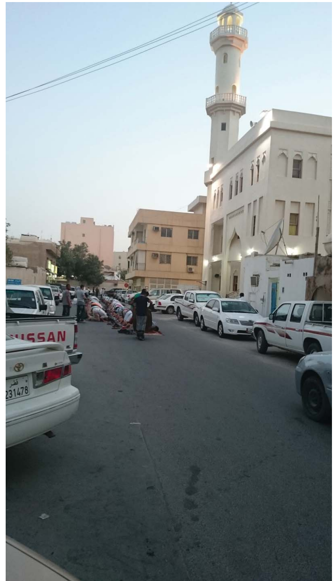
Figure 9. Migrant worshippers overflow the mosque in Al Ghanim on a Friday. (Color figure available online.)

Unlike those who are employed on two-year contracts, many of these men work as day laborers, putting them at greater risk of precariousness. Zulfikar pointed out the labor mundy (informal labor market [Figure 10]) that is opposite the gold souk, where Qataris go to hire skilled