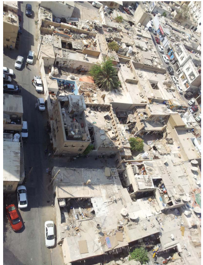
Figure 7. Backstage dwellings. (Color figure available online.)