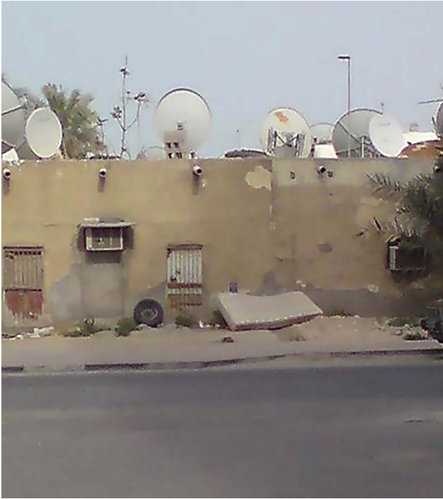
Figure 8. Backstage dwellings. (Color figure available online.)

8 a.m. as I [Robina] walk out to get breakfast I note that the park is already full. It is the Muslim Sabbath and there are men everywhere. Some of the Pathans are chatting and some are resting with friends. Later in the day, worshippers flow out from the mosque greeting those who were unable to fit inside and have had to pray out on the street on mats [Figure 9]. Eventually they disperse and it is quiet until the next prayer time. (Field notes, November 2012)