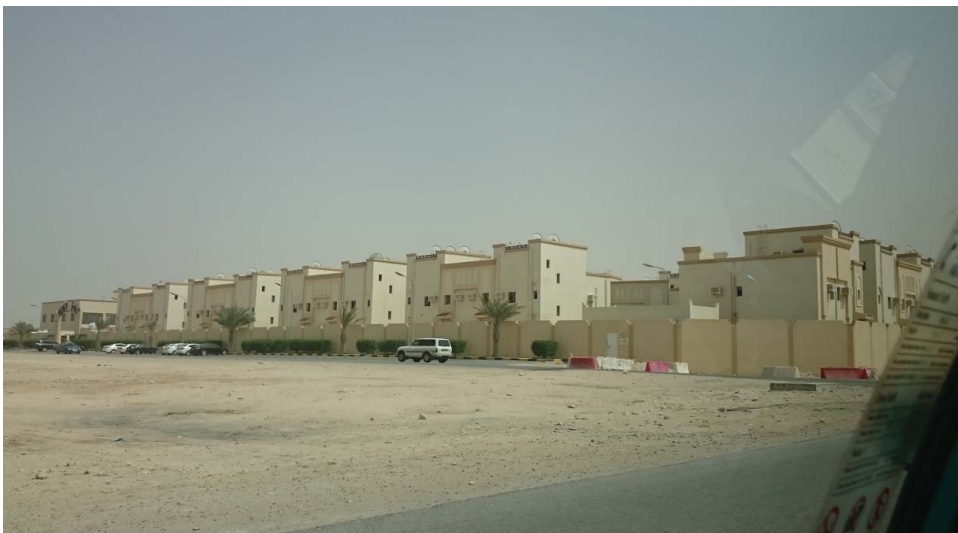
Figure 6. Recently constructed migrant worker housing at Doha's outskirts. (Color figure available online.)

This side, all of it is going to come down. Everybody has had a notice to vacate. They are going to destroy and then they are going to start work on the tube station. You can see the pictures here [hoardings marking the area have pictures of] . . . how it used to look like. There used to be more shops here. They have made a place for all these shops in Barwa village [a new mixed-use development about 10 km out]. It's like a big complex. It has lots of small, small shops. These people are being moved